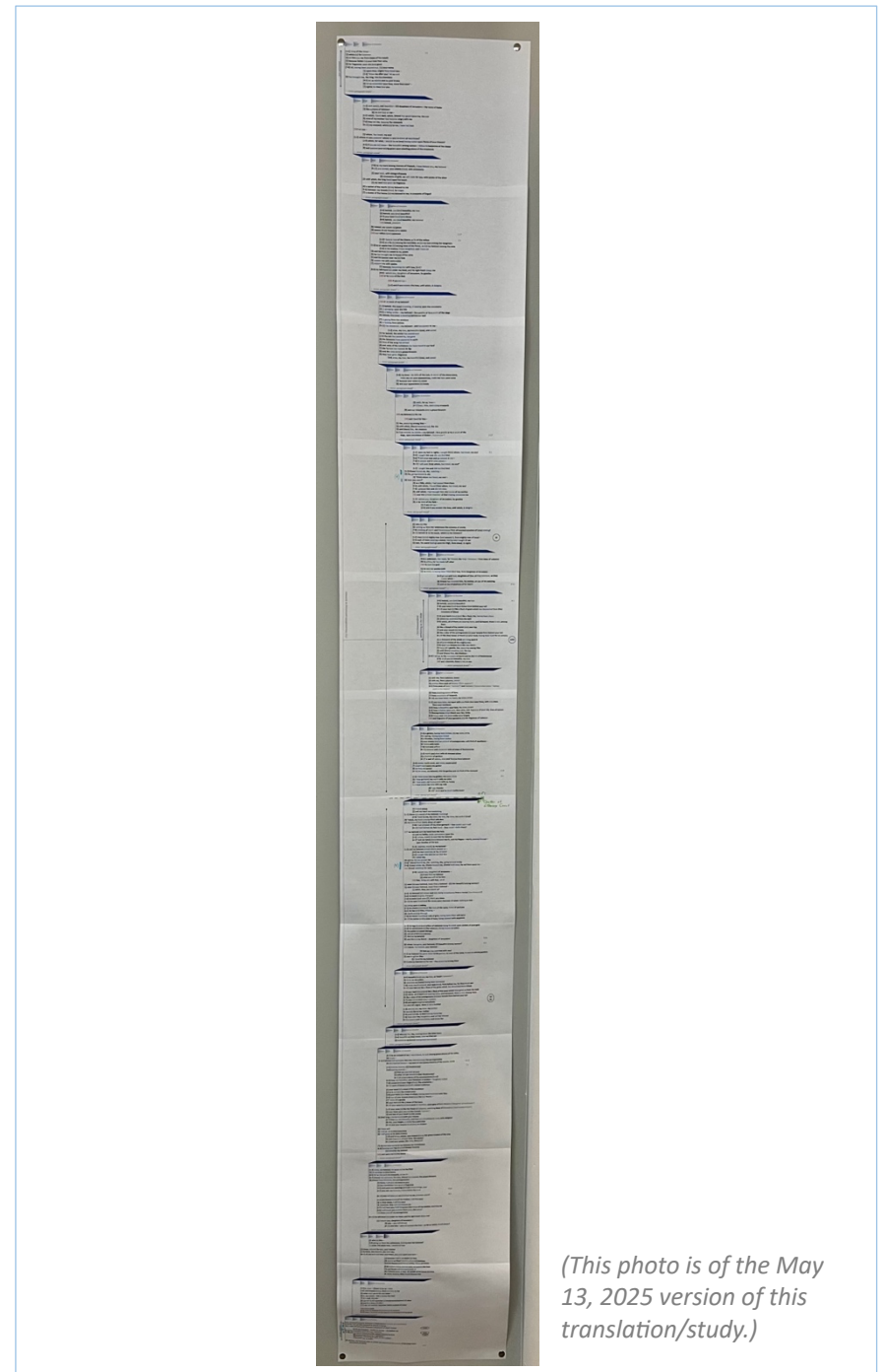
(This photo is of the May 13, 2025 version of this translation/study.)